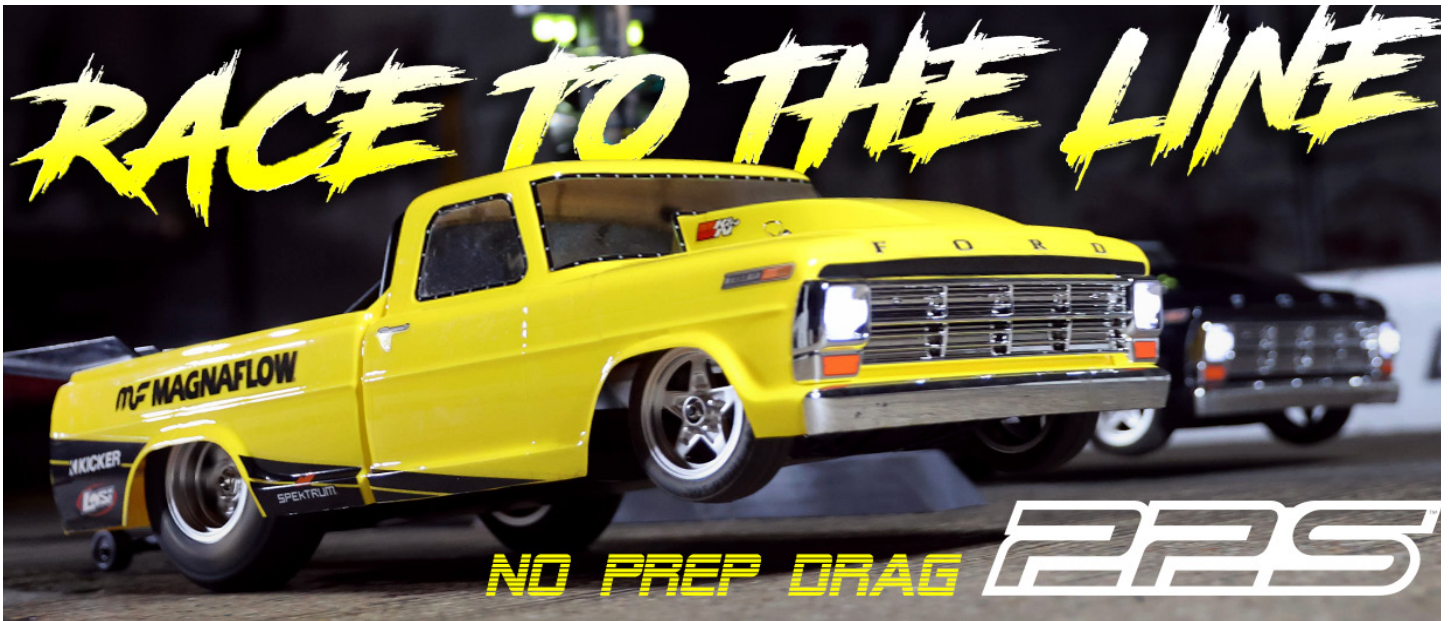
C-LOS03045T1/T2 1/10 68 F100 22S Drag Car, Brushless RTR Magnaflow / Losi

The Ford F100 has been carefully crafted to give a classic look while still fitting into the rules and regulations set by the No-Prep Drag Racing scene. It has all the advantages of an aluminium chassis such as electronics protection, side impact guards, and a clean wire management system with plenty of 22S option parts. It's designed with racers in mind with many outstanding features including officially licensed Mickey Thompson tyres, limited travel oil filled front and rear shocks, low centre of gravity rear shock tower, extended body mounts, optional heavy duty sway bar, adjustable weight front bumper, elevated transmission, adjustable turnbuckles, and a fully adjustable wheelie bar. You get an all-metal gear transmission for concrete dependability along with a Spektrum SLT3 transmitter and dual protocol receiver, Spektrum Firma 100 amp Smart ESC, and Spektrum Firma 6500kv brushless motor. From its rugged body to state-of-the-art electronics, everything about the Losi 1968 Ford F100 No Prep Drag Racing Truck is ready for blazing down the blacktop.