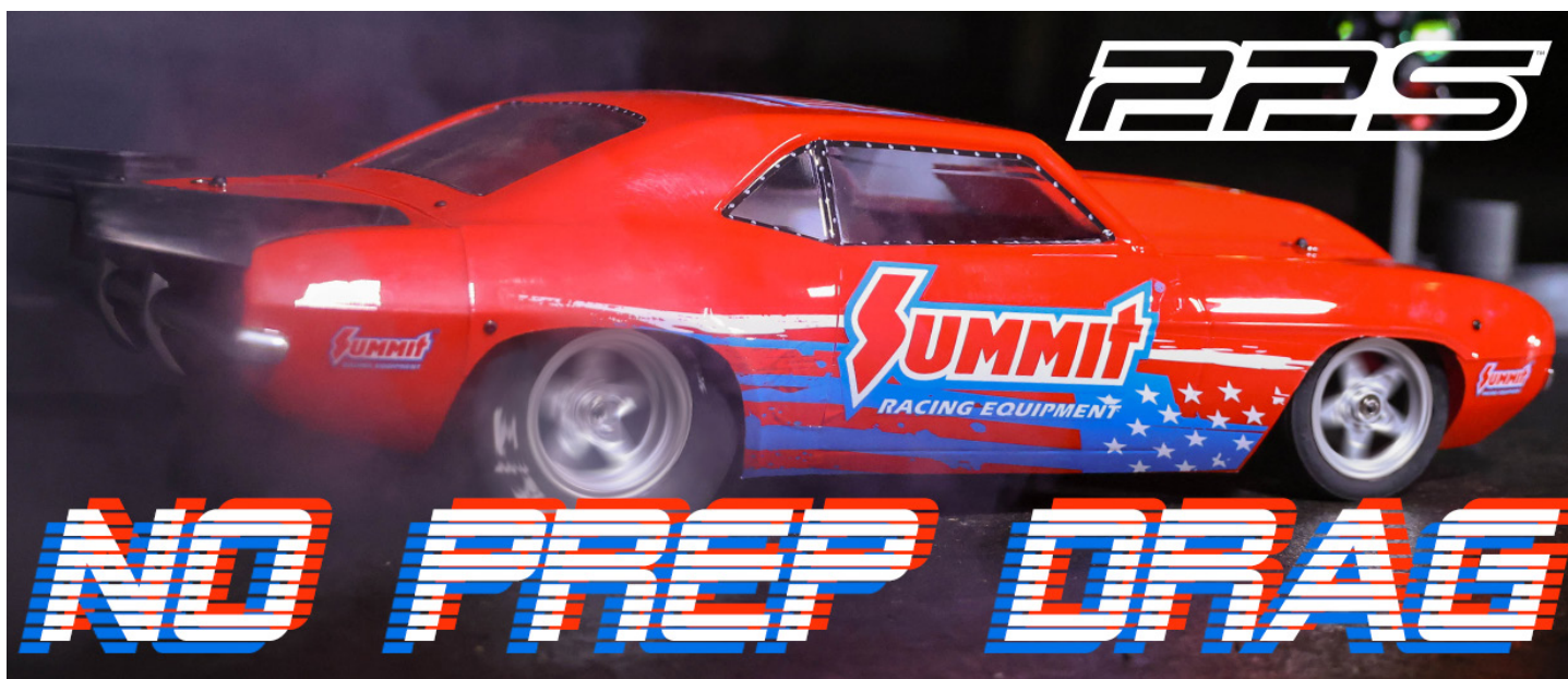
C-LOS03035T1/T2 1/10 69 Camaro 22S Drag Car, Brushless RTR Summit / Blue

The 69 Camaro has been carefully crafted to give a classic look while still fitting into the rules and regulations set by the No-Prep Drag Racing scene. It has all the advantages of an aluminium chassis such as electronics protection, side impact guards, and a clean wire management system with plenty of 22S option parts. It's designed with racers in mind with many outstanding features including officially licensed Mickey Thompson tyres, limited travel oil filled front and rear shocks, low centre of gravity rear shock tower, extended body mounts, optional heavy duty sway bar, adjustable weight front bumper, elevated transmission, adjustable turnbuckles, and a fully adjustable wheelie bar. You get an all-metal gear transmission for concrete dependability along with a Spektrum SLT3 transmitter and dual protocol receiver, Spektrum Firma 100 amp Smart ESC, and Spektrum Firma 6500kv brushless motor. From its unmistakable body, to rapid handling, everything about the Losi 1969 Camaro Drag Car is ready to provide racing thrills like nothing else.