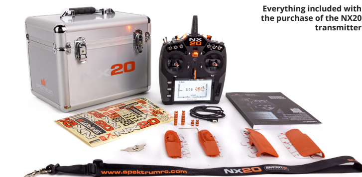
Everything included with the purchase of the NX20 transmitter

The NX20 includes programming for airplanes, sailplanes, helicopters, and multi-rotor models, with 14 programmable mixes and up to 10 different flight modes and 8 sequencers.