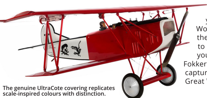
The genuine UltraCote covering replicates scale-inspired colours with distinction.

Whether this is your first giant scale World War I aircraft or the perfect complement to your scale collection, you won't find a replica Fokker D.VII that better captures the spirit of this Great War Legend!